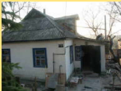
Latest outside picture of house