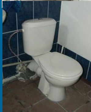
My toilet before and after