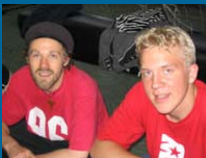
Some of the young people enjoying the ministry centre.